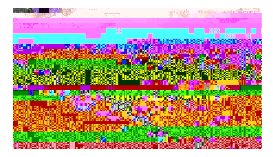
Environmental Process Flow chart